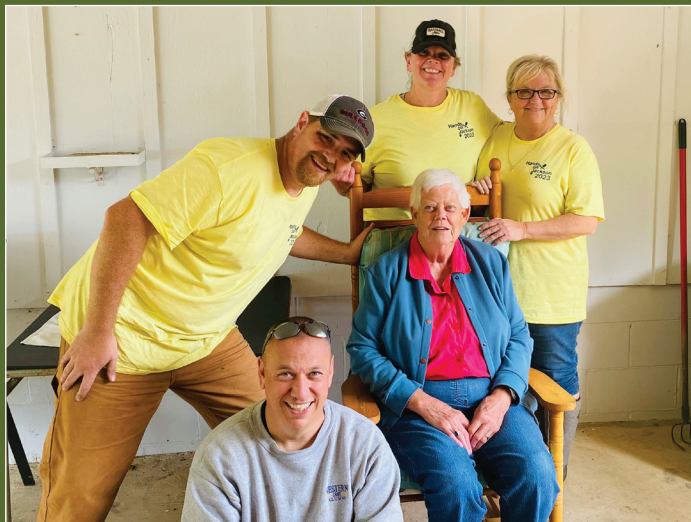
JCDS staff participated in Hands on Jackson, an annual county-wide event during which volunteers provide assistance to folks who need a hand.