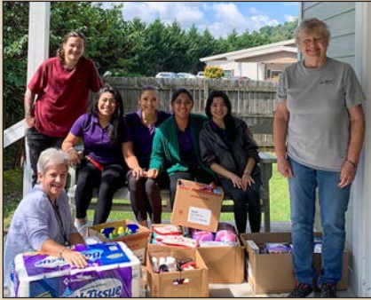
(Left) JCDSS staff participated in Hands on Jackson Project, annual event where community volunteers provide assistance across the county to help folks who need a hand.