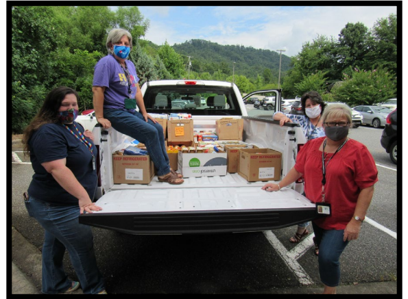
JCDS staff had a fundraiser for United Christian Ministries and collected 14 boxes of food.